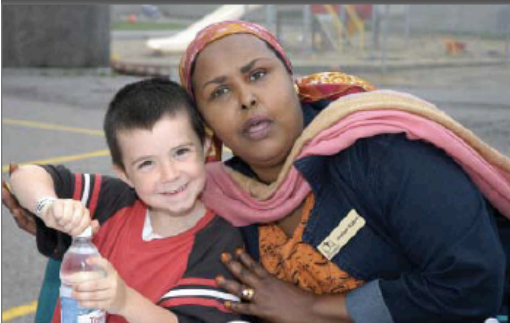
Averigüe cómo puede ofrecerse de voluntario en la escuela.