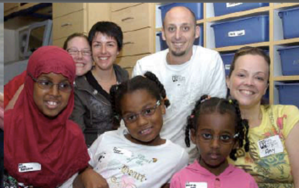
Asista a los eventos especiales de la escuela.